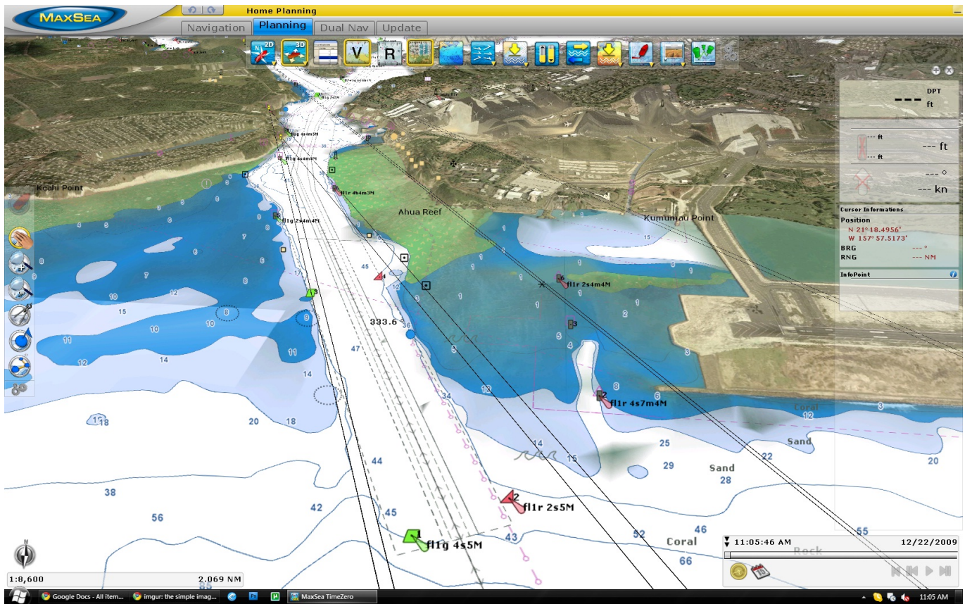
Maxsea 12.6.4.1 Crack